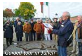
Guided tour in Jülich

Contact and booking for guided tours: Stadt Jülich, Office for city marketing and culture Tel. +49 24 61 63-419, Fax +49 24 61 63-362, e-mail: stadtmarketing@juelich.de booking form: www.juelich.de/buchungstadtuehrung