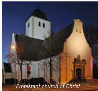
Protestant church of Christ