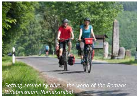
Getting around by bike – the world of the Romans (Erlebnisraum Römerstraße)