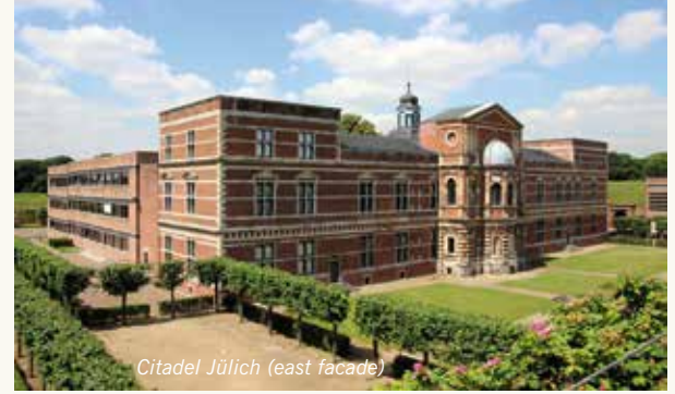
Citadel Jülich (east facade)