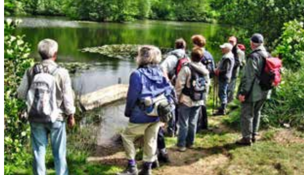
Hiking along the river Rur