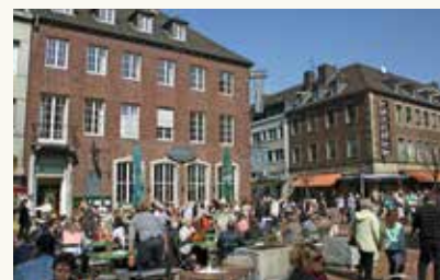
Stroll and enjoy the Jülich downtown

The old town hall was built in 1953/54 according to the plans of René Schöfer. In the 1st century, the Roman highway Köln-Jülich-Maastricht-Boulogne-sur-Mer on the Channel coast ran diagonally across today's market place – about 3 m below the current level (indicated by grey nature strip).