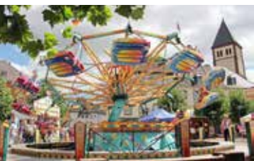
Summer fair in the centre

Period festival, pirates, autumn lights, etc.